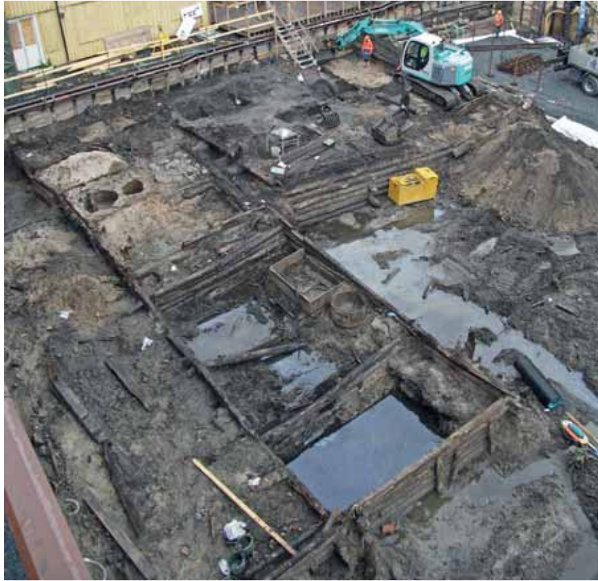
Figure 1. Aerial photo from the 2008 excavation at the Ansvaret block, Jönköping. The caissons of the plots are visible.

as analyses based on empirical observations now tend to take place in dynamic intersections where new approaches tend to combine social organization and agency with spatial and material dimensions. The household as a unit for organizing property, production and consumption is confronted with the household as ideology, discourse and manifestation. The relationship between the physical house and the household as a social unit is no longer evident and has to be discussed. This makes possible new per-