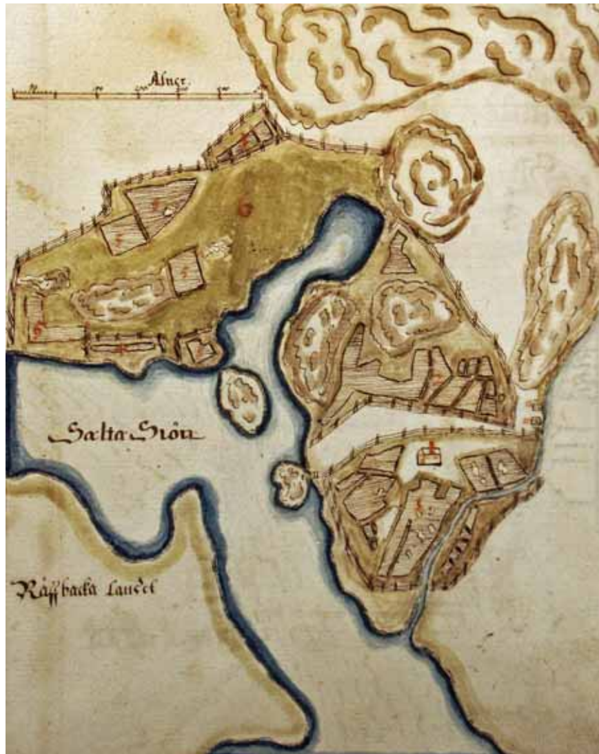
Figure 1. Kårböle, a single farm or a former hamlet in Tenhola parish, Uusimaa (Swe. Nyland), Finland, on a map drawn by Hans Hansson in 1647. In the NW one can still see that a meadow as well as some fields of a deserted medieval hamlet called Gullböle are still in use by the neighboring hamlets. (Finnish National Archives)

Land surveyor Hans Hansson mapped several hamlets in the Parish of Tenala (Fi Tenhola) in 1647. One of