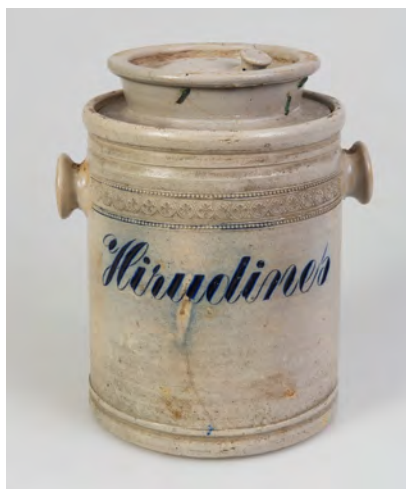
Figure 2. Leech jar from Uddevalla Apotek. Medicinal leeches were usually stored in this kind of jars in the pharmacies (Photo Bohusläns Museum).

quity. They were depicted in ancient Egypt 3,000 years ago, and they are mentioned in sources in different languages from the time the nativity of Jesus. In the Nordic countries the use of medicinal leeches for therapy is mentioned by Olaus Magnus in his Historia de gentibus septentrionalibus (1555 book 22, s. 5). It was also mentioned in a Swedish medicinal handbook from the seventeenth century (Lindh 1675, s. 25). However, it was not until the eighteenth century that leeches became more widely used in medicine in Sweden. The wild species is rare in Scandinavia. In the mid-eighteenth century the medicinal leeches used in Sweden were therefore commonly imported from England, according to Linnaeus (Lönnberg 1913, s. 296). Linnaeus named the species Hirudo medicinalis and he was probably describing adult, 10