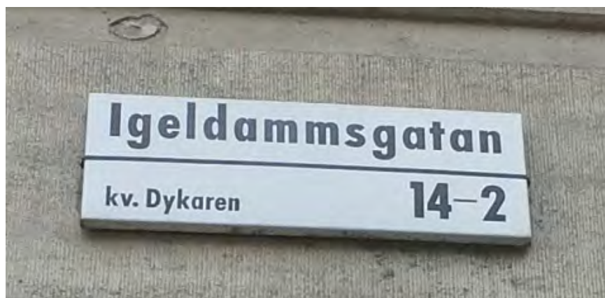
Figure. 1. Street sign for the “Leech-pond Street” in Stockholm

ally keep fish caught in nearby rivers in store-ponds. Another alternative was to produce the fish themselves in breeding ponds. Although fish-ponds for storing and breeding fish, mostly cyprinids, were common in Swedish urban areas in the seven-teenth and eighteenth centuries, traces of those are rare (Bonow & Svanberg 2016a, s. 104). A few urban ponds remain though – such as the Svandammen (‘The Swan-pond’) in the centre of Uppsala (founded as a fishpond in 1570). Archaeological remains of former ponds are rare and very few of them have been scientifically investigated (Bonow & Svanberg 2016b). Some toponyms recall now lost ponds, like Zinkensdamm and Ruddammen in Stockholm, Ruddammsgatan in Gävle and the urban block Rudan in Uppsala. There are many other examples (Bonow & Svanberg 2012, s. 139–140).