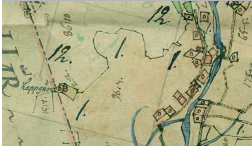
Figure 2. Detail of a map (Sw. avvittringskartan ) from 1803 showing a homestead labelled 'lappgård' in the Lillpite village, Piteå parish. Map from Lantmäteriets historical archive of maps.

areas, has largely been erased by later land use, leaving only marks on the maps.