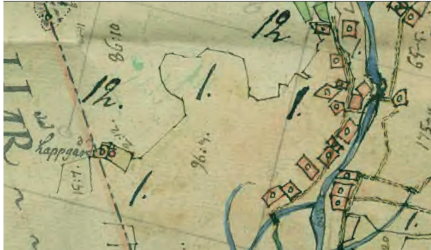
Figure 2. Detail of a map (Sw. avvittringskartan ) from 1803 showing a homestead labelled 'lappgård' in the Lillpite village, Piteå parish.

areas, has largely been erased by later land use, leaving only marks on the maps.