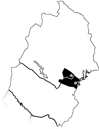
Figure 1. Map showing the study area.

the Piteå and Älvsbyn municipalities in the south-eastern parts of the county of Norrbotten (Fig 1). This analysis draws on archaeological remains, historical records, place names and oral tradition among Sámi as well as local villagers. Inter-community relations are analysed and interpreted as they have played out in the landscape, specifically in relation to the concept of Lappmarker and the establishment of the Lapland border (Sw. Lappmarksgränsen ) in the middle of the 18th century.