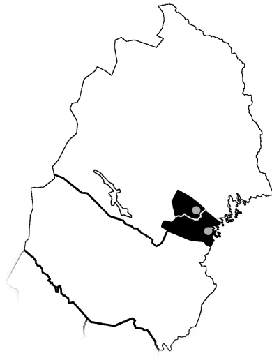
Figure 1. Map showing the study area.

the Piteå and Älvsbyn municipalities in the south-eastern parts of the county of Norrbotten (Fig 1). This analysis draws on archaeological remains, historical records, place names and oral tradition among Sámi as well as local villagers. Inter-community relations are analysed and interpreted as they have played out in the landscape, specifically in relation to the concept of Lappmarker and the establishment of the Lapland border (Sw. Lappmarksgränsen ) in the middle of the 18th century.