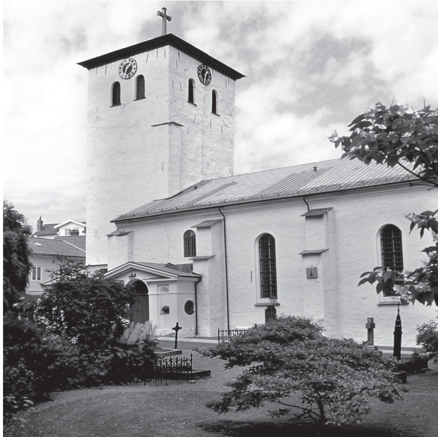
Figure 5. Mariakyrkan in Marstrand, facing northwest. The remains of the Franciscan friary partially excavated between 2017 and 2018 are located in the cemetery area on the left hand side of the photograph.

built something on Marstrand. The key question here is what he did build. For reasons that will be further developed in the following, I reject the idea of any town-like settlement on Marstrand before the turn of the 14th century. In my view, it is not until the second part of that century that there are somewhat clearer evidence of the existence of a town. However, even if one accepts that the town of Marstrand was formally founded by King Haakon, there is a need to explain what his build-