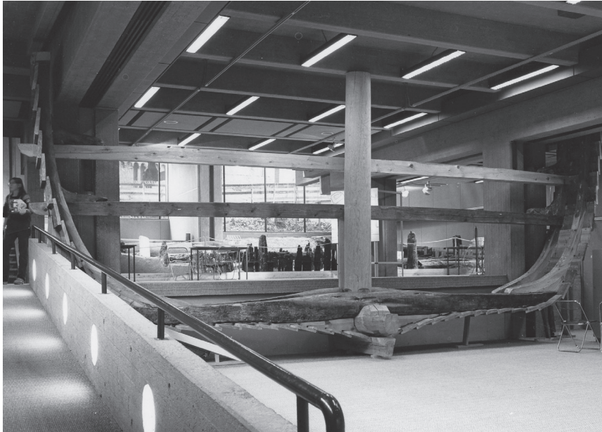
Figure 2. The “Big Ship”. Parts of the “Building Historical Section” is seen in the background, as well as St. Mary’s outside the windows.