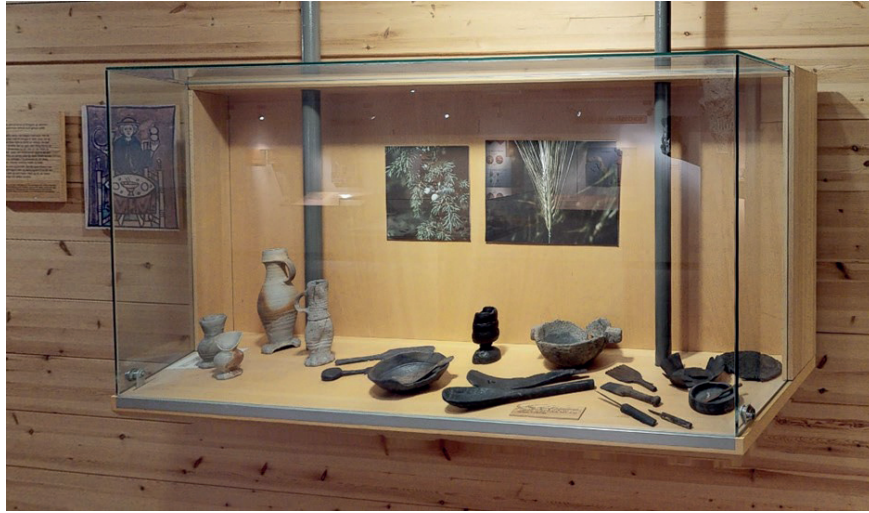
Figure 6. Showcased kitchen utensils.

well as a reconstructed interior, and now inhabited by plaster “mannequins” dressed in medieval clothes. The “tenement” also included built-in showcases with associated archaeological artefacts like toys, kitchen utensils, pottery, gaming pieces, tools, remains of clothes, jewellery and dress accessories (Figure 6). The rearmost part represented a revised and extended edition of “ Øvrestretet ” from 1976 including “workshops” presenting archaeological remains. Next to the “tenement”, there was a relatively open area dedicated to Bergen as a royal, ecclesiastical and cultural centre. This also included a few showcases, the statue of St. Mary and the altar frontal from the 1976 exhibition, and some remains of columns. All parts of the exhibition and their associated showcases were like in 1976 complemented by texts, maps, photos and other illustrations.