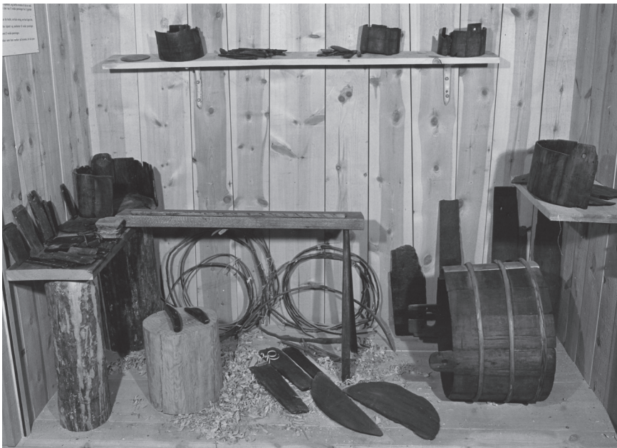
Figure 3. Diorama: “The turner and the cooper” (workshop).