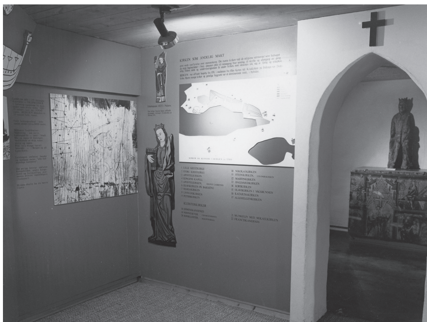
Figure 4. The Church on display.

the exhibition. Artefacts and results from the Bryggen excavation were highlighted, as well as preliminary finds from the ongoing excavation of the small town Borgund outside Ålesund. Neither should the archaeological impact of the extensive excavation site and the impressive “ Big Ship ” be underestimated. In addition, the many colourful thematic stations filled with texts, drawings and other illustrations, as well as the in-depth handbook contributed to an overall impressively comprehensive and informative presentation of the Middle Ages and medieval material culture. Within this context, medieval archaeology and artefacts immediately strikes one as being a