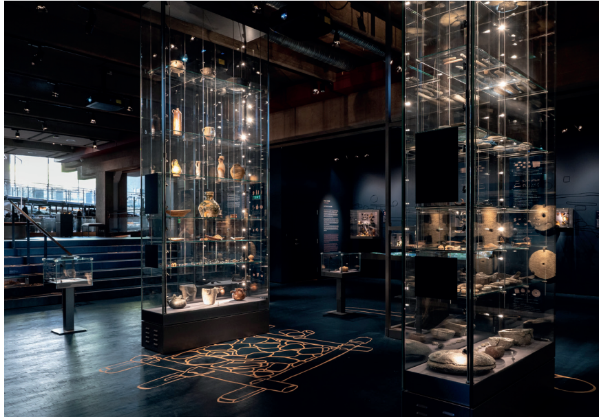
Figure 1. From “Below Ground. Medieval Finds from Bergen and Western Norway” (2020).

and role of the artefact within medieval archaeological research primarily from the 1970s and towards the new millennium initiates the presentation and discussion of the two exhibitions. The analysis of the exhibition from 1976 is mainly based on unpublished archive material – like photos, drawings and documents – and reservations are made that not all content and design elements have been captured. The documentation from the 1986 exhibition, on the other hand, also includes first-hand experiences from my own work at Bryggens museum as senior curator. An inclusion of activities that have taken place in or in relation the exhibitions, other public events, as well as temporary exhibitions may