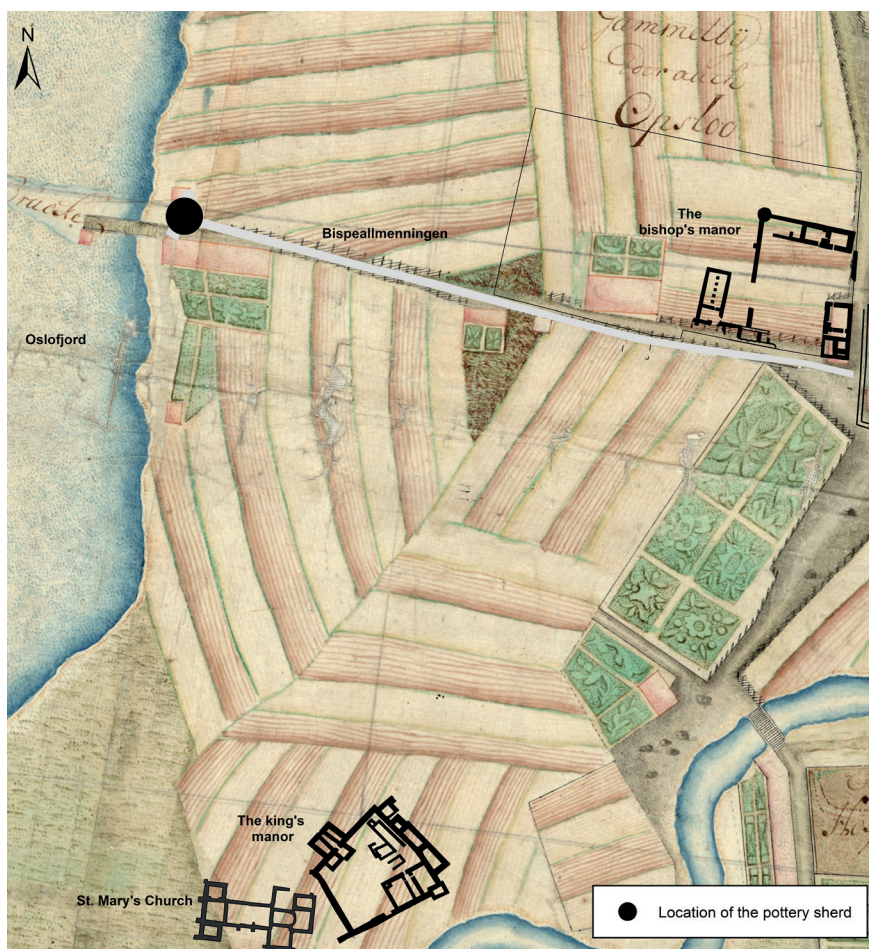
Figure 1. This map dates to 1700 CE and is the earliest map which shows Oslo's shoreline. The pottery sherd and corresponding harbour constructions lay on dry land at this point but would originally have been part of a pier which stretched out into the sea. This map also shows a pier at the end of Bispeallmenningen which illustrates how sea regression continued westwards into the eighteenth century. Map: Kristiania amt nr 7 øst: Carte von Agerhuus und der Stadt Christiania (øst). Statens Kartverk. Map by Mick Derrick/NIKU.

of a wharf, which projected out from the western end of Bispeallmenningen, the road leading down from the bishop's manor to the shoreline. These deposits lay on top of a wooden harbour construction dating to the mid-15th century CE, and immediately under a new phase of building