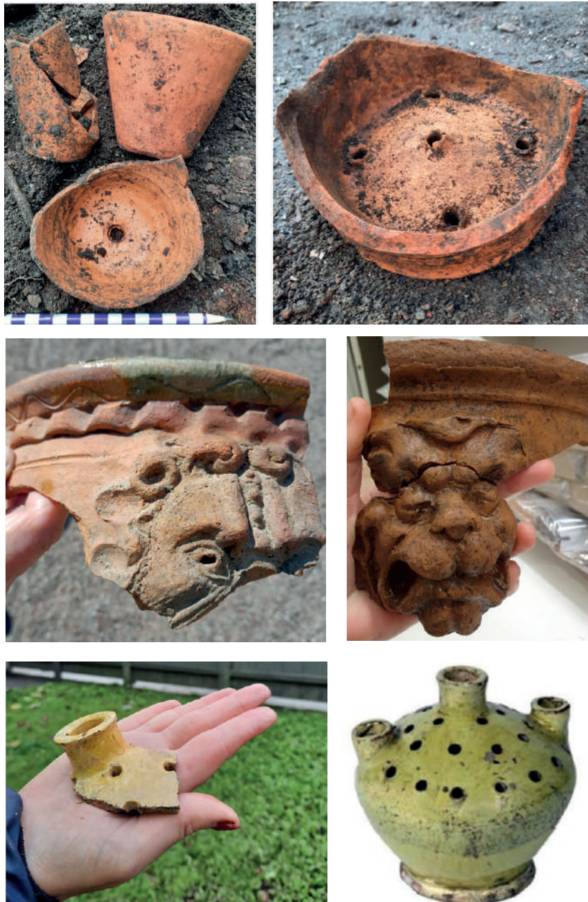
Figure 10a: Examples of planting pots from the Linnean household (left) and planting pots from Frisens park (right). 10b: Two urns from the Linnean household. To the left, a large urn with a Medusa head. To the right, an urn decorated with a lion head. 10c: The sherd of a yellow tulip vase found during the excavation (left), and the exhibited tulip vase in the Linnean museum in Hammarby, just south of Uppsala, to the (right).