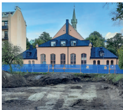
Figure 7. One of the garden quarters, where white sand was laid out, most likely to create a contrast to the darker paths and cultivation beds.

The excavated garden was located in the Rosendal quarter, on the outskirts of 17th-century Stockholm, and was owned by a vicar in the latter half of the century. He was a highly prestigious individual, serving as the priest to the court and queen (Hållans Stenholm & Lindeblad 2023). The garden remnants in Rosendal appear to be unique within a Swedish urban context due to their complexity, variability, and exceptionally diverse and well-preserved archaeobotanical material. Plant residues, as well as finds related to fertilisation and soil improvement, were abundant. These discoveries significantly contributed to understanding the varieties of cultivated plants and