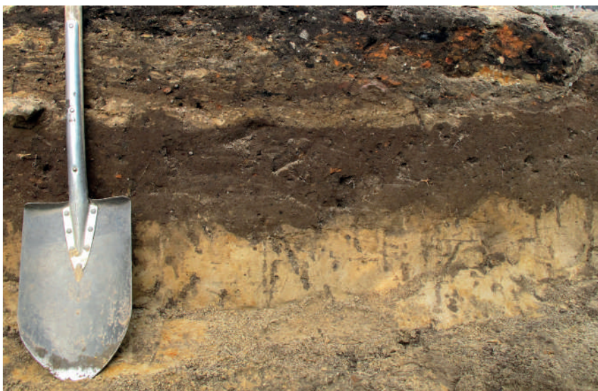
Figure 2. A cross-section of occupational layers containing buried garden soil from an excavation in the town of Norrköping, Östergötland. At the base of the cross-section, within the yellow sand, traces of earthworm activity and root growth are visible. Above this, the brown homogenised buried garden soil can be seen. In the interface between the sand and the subsoil, distinct traces indicate that the garden soil was cultivated using spades.

Lindeblad & Petersson 2009; Lindberg & Lindeblad 2013:79; Lindeblad & Nordström 2014). This method has been developed with the understanding that garden and horticultural remains differ significantly from those of buildings, streets, waste deposits, and conventional occupational layers. Garden soils are typically formed over an extended period and are often largely homogenised due to repeated cultivation. As a result, cultivation layers frequently lack distinct stratigraphy and/or visible structures (figure 2).