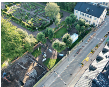
Figure 8. The reconstructed Linnaeus Garden and private home of the Linnaeus family in Uppsala, with the excavation in the left corner of the picture.

mial classification system for plants and animals). In 1741, Linnaeus was installed as Professor of Medicine and Botany at Uppsala University and subsequently, he and his family moved to the newly renovated Prefect accommodations adjacent to the likewise renovated botanical garden (figure 10). The renovated botanical garden was designed based on Linnaeus's new classification system and organised after the seasons. In the back of the garden, a modern orangery had been built for cultivating and preserving exotic tropical plants.