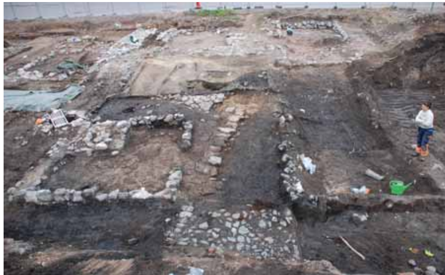
Figure 3. The smithy on plot no. 284.

In a register from 1742 Hallberg is identified as a blacksmith in the countryside outside Kalmar, but in 1750 he was counted among the master blacksmiths of Kalmar. These sources don't deliver any waterproof evidence of Anders Hallberg's whereabouts, but they definitely indicate that he lived in Kalmar many years before he moved to plot no. 284. There seems thus to have been a time lap here between the building of the forge and the presence of a blacksmith living on the same plot.