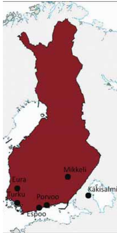
Figure 1. Location of the studied sites.

The Church of the Holy Spirit is situated in the centre of Turku (fig. 1). The church was built in the 16th century for the Finnish speaking part of the parish. The Cathedral of Turku was reserved for the Swedish speakers. The place was studied first time as a trial excavation in 1964 (Laaksonen 1965, s.27) and later on during the years 1983-85 (Laaksonen 1984, 1985; Kykyri 1985). There were over 1100 individuals counted to be buried in the 200 m 2 area in SW-NE, NE-SW and E-W orientation (Laaksonen 1965, 1984; Kykyri 1987, s.25). Only a sample of the animal bones from the excavation of 1985 was analysed: in total 260 fragments. The bones are mainly from graves, but some are stray finds from the area. Cattle bones were the most frequently found animals in the graves. The anatomical representation of the cattle is emphasized by teeth, forelegs and phalanges. Sheep and/or goat are anatomically evenly distributed with a light increase on vertebra and limb bones. Pig bones are also anatomically evenly distributed. Bones from the feet were found of the mountain hare ( Lepus timidus ). Northern pike ( Esox lucius ) and Perciformes ( Percidae ) were found in two graves, although in