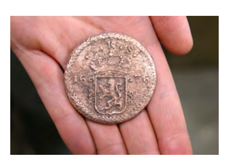
Figure 3.A just found öre from a farm site in Schellinkhout.

coat of arms of the Kingdom of Sweden, recognizable by a cross quartering the shield may be seen on the obverse side (verso) of the coins. Three crowns can be seen in the first and third quarter of the shield. In the second and fourth quarter a crowned lion is depicted over three sinister wavy bendlets. In the centre the Arms of the House Vasa is shown by stalks of wheat. The edge lettering reads GVST(AVUS) ADOLPH D.G. SVEC.GOTH.VAN. (REX) M.P.F. On the reverse (recto) of the coins minted in the town of Säter, the crossed arrows of the arms of the Province of Dalarna can be seen. Between 1 and ÖR, MONETA NOVA CVPREA DALARENSIS is inscribed on the edge, along with the year that the coins were minted, in Roman numerals (fig. 7). On the reverse of the 1 öre coins that were struck in the harbour town of Nyköping in 1628 or 1629 the arms of the Province of Södermanland, a griffon with upright wings is shown. The value 1 ÖR is also shown on the reverse with the edge inscription MONETA NOVA CVPRE NICOPENSIS and the year of that the coins were minted in Roman numerals.