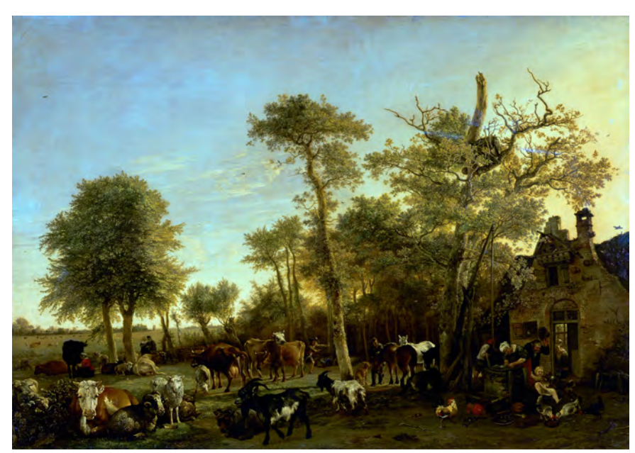
Figure 13. Painting by Paulus Potter of the Westfrisian countryside with a so called Stolp farm in 1639. The inhabitants were both farmers, skippers and invested in cargoes.

the West-Frisian Ring Dike, close to the Zuiderzee (tab. 1). It is not possible at this point in time to provide a comprehensive overview of finds of Swedish coins from elsewhere in The Netherlands. A quick scan through the coins found in the province of North-Holland suggests that Swedish copper coins are known from Amsterdam, Alkmaar, Callantsoog, Heemskerk and the Isle of Texel. The amount of coins found on this island is relatively high, with 12 examples so far. One