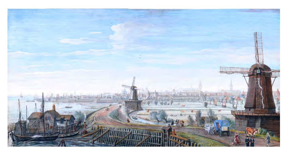
Figure 1.View at Hoorn and the Westfrisian Ringdike by Gaspar van Wittel, 1731. Much Scandinavian wood was used in windmills, houses and revetments.

and outlying villages. Metal detectors have been routinely employed to search for artefacts and excavated soils have been meticulously detected, producing an abundance of coins (fig. 2). A large number of the coins that have been recovered ori-