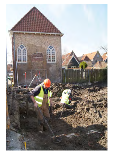
Figure 2. Metal detecting at the site of Gedempt Achterom 45 next to the former Synagogue in the town of Medemblik, 2012.

ginated in Sweden (fig. 3). Indeed, because of their sheer size, they can hardly be missed. Apart from finds of from systematic excavations, this article also discusses coins from private collections and others held by the West Frisia finds depot.