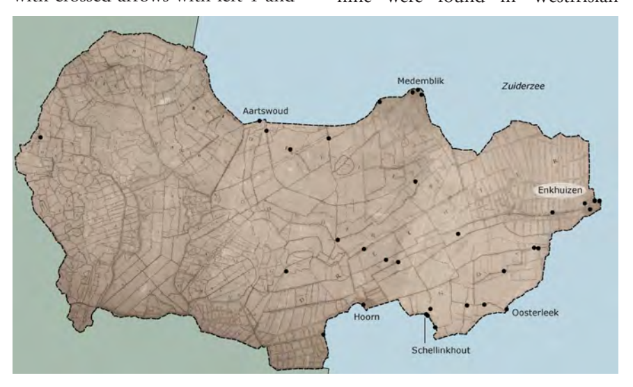
Figure 12. Map of West-Frisia with locations of finds of Swedish copper coins plotted on the map of 1651. The dotted line is the late medieval ring dike.

Of the 37 coins mentioned above nine were found in Westfrisian