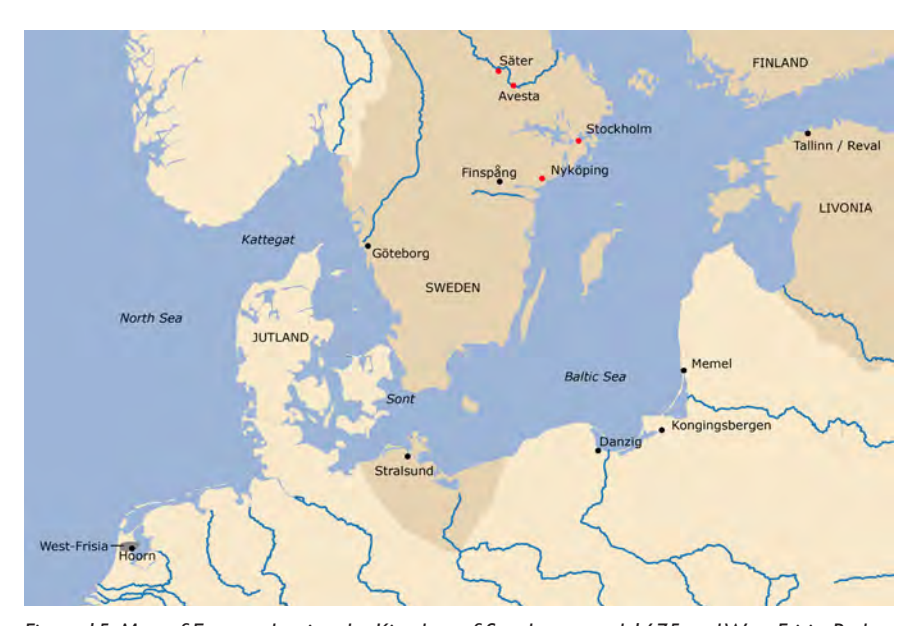
Figure 15. Map of Europe showing the Kingdom of Sweden around 1675 and West Frisia. Red dots are places of mint.

town plan of the town of Göteborg founded by King Gustav II Adolf in 1621. Jakob van Dijck and Abraham Cabeljau (Cabilau) even became lord-majors of this major town in western Sweden (NN, 1931). It is known that King Gustav II Adolf purchased firearms and ordnance from the Dutch gun founder and arms trader Lodewijk de Geer in 1618 (NN, 1907). After that De Geer built a substantial iron- and copper mining and melting industry in and around Finspång in the Province of Östergötland and was given the monopoly of the ironand copper trade by King Gustav II Adolf (Romein & Romein-Verschoor, 1977).