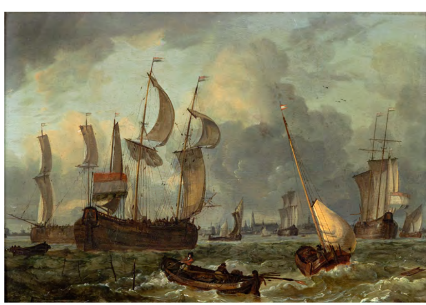
Figure 14. Painting by C. J. Rietschoof of ships at the sound of Hoorn around 1700. So called katships were designed to carry loads of timber from Norway and the Baltics to the Netherlands.

example is striking: a 1 öre coin of King Karl XI were colourful pieces of class were mounted into the coin and a clip was adhered to make it a brooch (Collection Daalder, determined by Enno van Gelder 21-9-1960, KPK letter 1135). Coins are rarely found outside the province. Most of the coins from West-Frisia are unstratified finds, recovered from the top soil of farm sites, pasture fields or dumps of town waste (fig. 13). It is impossible to know if such finds were intentionally discarded, or lost. Aside from these unstratified finds, two coins have been recovered from the cool store of a dike house at Schellinkhout. This small brick cellar was backfilled around 1680 and the inhabitant of the house was active in maritime transport (fig. 14). (Gerritsen, 2016, 409-410).