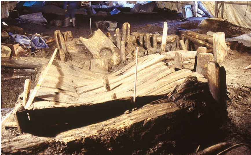
Figure 3. This timber framed privy found in Turku was built at the end of the 14th or early 15th century. The size of the privy was c. 5 m 2 and it contained a seat meant at least for two people. The privy was probably emptied prior to its abandonment at the end of the Middle Ages since the soil inside did not contain manure (Seppänen 2012b, p. 432).

Besides latrines, medieval sanitation and especially personal hygiene are often combined with the availability of privies in urban environment. In many studies, latrines are equalled with privies, since quite often they were used for the same purpose and it might be difficult to distinguish any difference between these constructions. If conclusions about the sanitation in the medieval Turku were made exclusively on the basis of the frequency of privies, we would have to admit that the sanitation