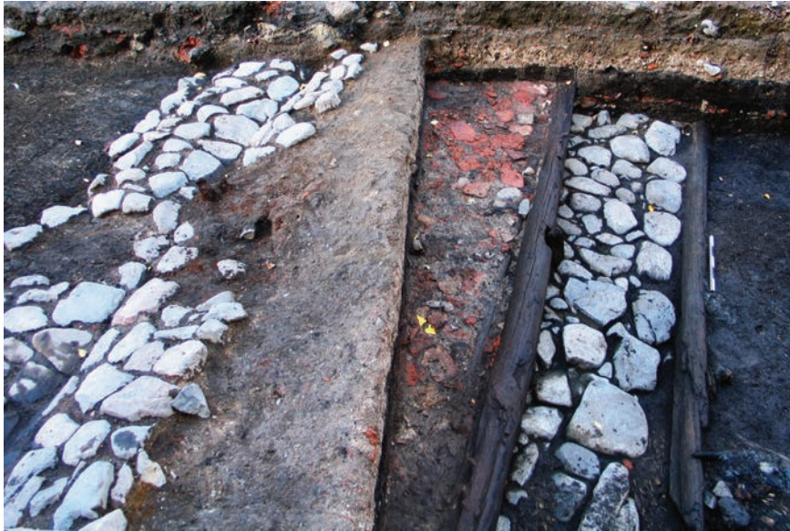
Fig. 7. The photo presents the stratigraphy of different pavements and phases of the School Square. In the oldest phase (on right), the square was provided with a stone paved lane framed with logs. In the next phase (middle), the lane was paved with bricks while the square remained unpaved. The square was paved with stones in the late 15th century or in the early 16th century (left).

102). This information has led to the conception that the squares of Turku were not paved prior to the 18th century. However, the archaeological excavations on School Square in 2005–2006 revealed that the square was paved with stones already during the late 15th or early 16th century when the paving of streets had become more common in Turku (Fig. 7). It is possible, that also the Market Square was paved in the late 15th or early 16th century, since this was the time when the streets in the central town area leading to Market Square were paved with stones. However, evidence about the surfaces and maintenance of squares of Turku can be achieved only with new archaeological excavations.