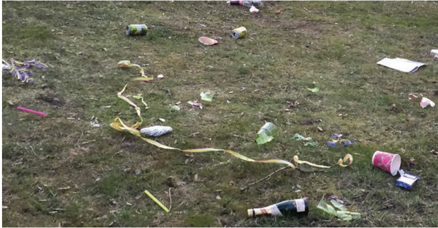
Figure 8. Conceptions of waste are time and culture bound. If one arrived in Turku on the first of May, (s)he would get a completely different image about the manners of the people and sanitation of the town than in other times. Every year, despite organised waste management and instructions, the traces of celebration can be seen everywhere until they are cleaned with extra effort and costs.

However, based on available material and studies, it seems that there were actions and practises related to organized and systematic waste management from the late 14th and early 15th centuries onwards in Turku. The organized sanitation was probably catalysed by new ideas, legislation, population growth and intensified activities in the urban sphere. New ideas about sanitation were not, however, necessarily connected to population growth everywhere. James Deetz, who studied three cities from the 18th century, discovered that all cities adopted new ideas related to sanitation simultaneously regardless of the size, situation or social status of the cities (Deetz 1996, p. 171–174). Deetz's study demonstrates that changes in sanitation can be connected with mental and attitudinal changes rather than with the