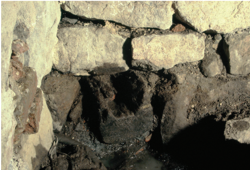
Figure 4. Wastewater management and placement of sewers was considered in the planning and construction of buildings, too. A masonry building from the 15th century was provided with a timber sewer leading the waters to the gutter of the adjacent street (Seppänen 2012b, p. 882).

vealed some evidence about sewers in medieval contexts. The oldest sewers of Turku were probably connected to the two aforementioned brooks running in the central town area. There are no exact datings available, but constructions have been roughly dated to the period when the town was founded in the turn of the 13th and 14th century and they have been connected with a need to control the dampness of the area. There is more evidence about sewers from the contexts of the 14th and 15th century although the constructions themselves have not been dated. It is quite likely, that sewers have been used for many decades, even for the whole medieval period from the 14th century until the early 16th century. Some of the med-