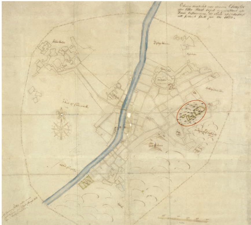
Figure 2. The location of Mätäjärvi has been marked with a circle and texture on the oldest map of Turku from the 1630s. On this map, there is no visible evidence of the lake and the only reference to the lake is the name of the hill (Mätäjärvi hill) on the south side of the marked area. The map does not provide any information about the medieval brooks either.

and animal excreta, which could have been used as manure in fields (Seppänen 2012b, p. 867, 872). When waste is used intentionally for fertilisation and as fill, insulation and absorbent material, it meets the criteria for recyclable waste and useful material and cannot be considered just waste any longer.