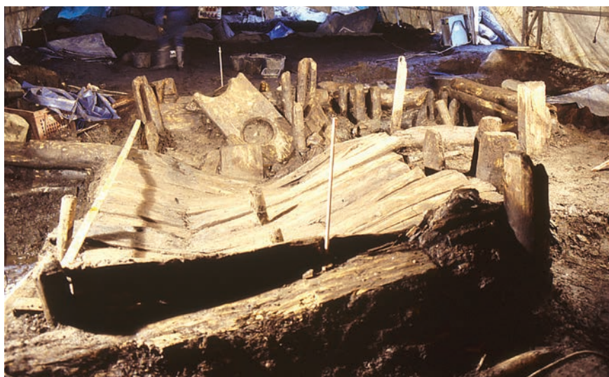
Figure 3. This timber framed privy found in Turku was built at the end of the 14th or early 15th century. The size of the privy was c. 5 m 2 and it contained a seat meant at least for two people. The privy was probably emptied prior to its abandonment at the end of the Middle Ages since the soil inside did not contain manure (Seppänen 2012b, p. 432).

Besides latrines, medieval sanitation and especially personal hygiene are often combined with the availability of privies in urban environment. In many studies, latrines are equalled with privies, since quite often they were used for the same purpose and it might be difficult to distinguish any difference between these constructions. If conclusions about the sanitation in the medieval Turku were made exclusively on the basis of the frequency of privies, we would have to admit that the sanitation