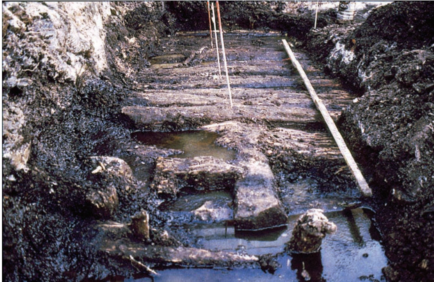
Figure 5. According to the present knowledge, the first streets with timber pavement were made in the 1370s in Mätäjärvi quarter (Seppänen 2012b, p. 461, original photo: The Museum Centre of Turku.).

central Turku were probably paved with stones (Seppänen 2012b, p. 927–929).