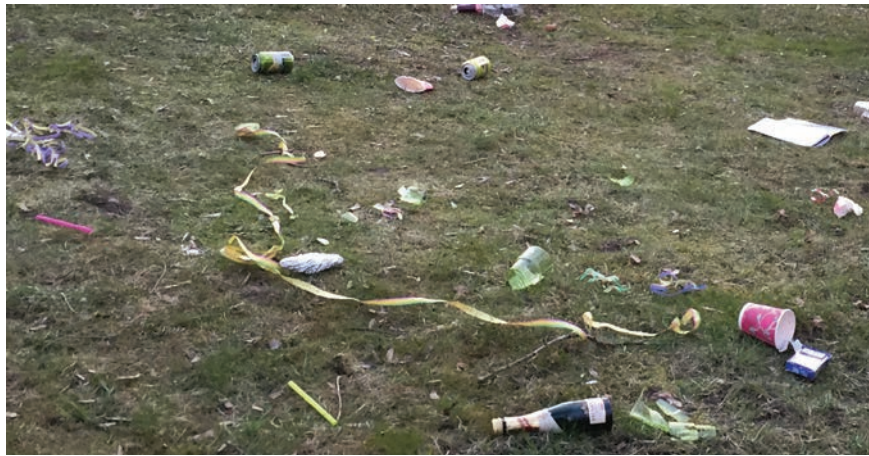
Figure 8. Conceptions of waste are time and culture bound. If one arrived in Turku on the first of May, (s)he would get a completely different image about the manners of the people and sanitation of the town than in other times. Every year, despite organised waste management and instructions, the traces of celebration can be seen everywhere until they are cleaned with extra effort and costs.

However, based on available material and studies, it seems that there were actions and practises related to organized and systematic waste management from the late 14th and early 15th centuries onwards in Turku. The organized sanitation was probably catalysed by new ideas, legislation, population growth and intensified activities in the urban sphere. New ideas about sanitation were not, however, necessarily connected to population growth everywhere. James Deetz, who studied three cities from the 18th century, discovered that all cities adopted new ideas related to sanitation simultaneously regardless of the size, situation or social status of the cities (Deetz 1996, p. 171–174). Deetz's study demonstrates that changes in sanitation can be connected with mental and attitudinal changes rather than with the