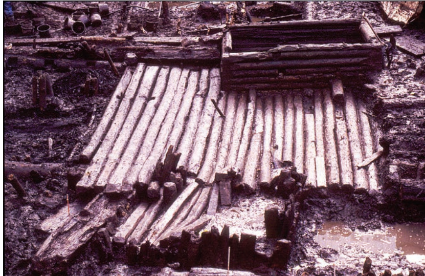
Figure 6. In Mätäjärvi quarter, a yard between two buildings was carefully paved with logs in the 1400s. The pavement covered an area of 43 m 2 (Seppänen 2012b, p. 359–365).

phase the square was unpaved. However, the square was provided with a stone paved lane lined with thick logs on both sides. The lane was 2.5 m wide equalling the width of smaller streets in the medieval Turku. In the late 15th century, the stone lane was replaced by a narrower brick lane framed with thick logs likewise its predecessor. Some of the bricks used for paving were profiled and originated possibly from the cathedral nearby (Fig. 7). The new passage was probably made after the fire in 1464, which caused severe damage to the cathedral and launched larger reconstruction activities in this area. The unpaved part of the square surface was covered with the remains of wooden dishes and other wooden material as well as with leather waste and broken artefacts