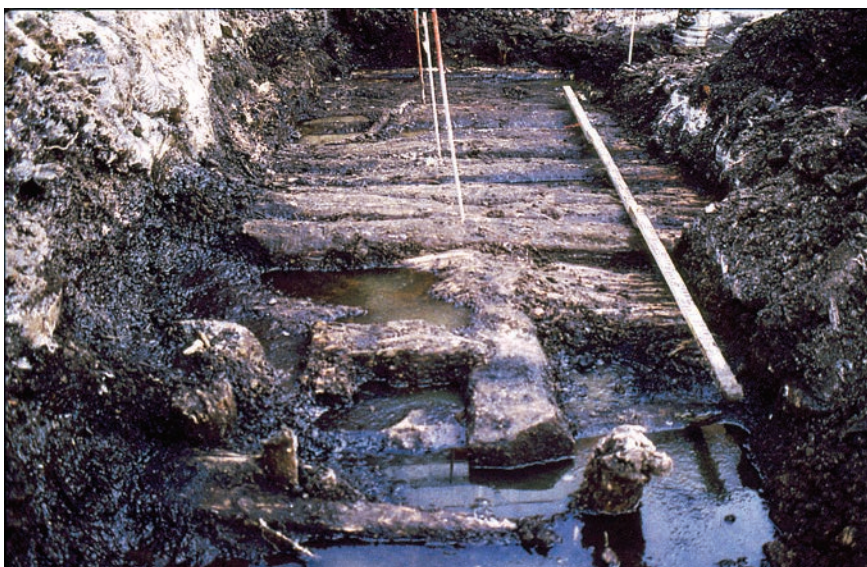
Figure 5. According to the present knowledge, the first streets with timber pavement were made in the 1370s in Mätäjärvi quarter (Seppänen 2012b, p. 461, original photo: The Museum Centre of Turku.).

central Turku were probably paved with stones (Seppänen 2012b, p. 927–929).