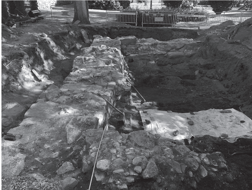
Figure 6. Excavation in 2017–2018 of the remains of the Franciscan friary in Marstrand revealed massive stone walls, representing the foundation of a large building to the south of Mariakyrkan, in what today constitutes the church's cemetery. The building has been 34–35 metres long and 12 metres wide, and was orientated in an east–west direction.

Larsen 2015, pp. 296–297), and in the late middle ages, they were involved in the issuing of letters of indulgence, which became an important source of income (Digernes 2010, pp. 77–79).