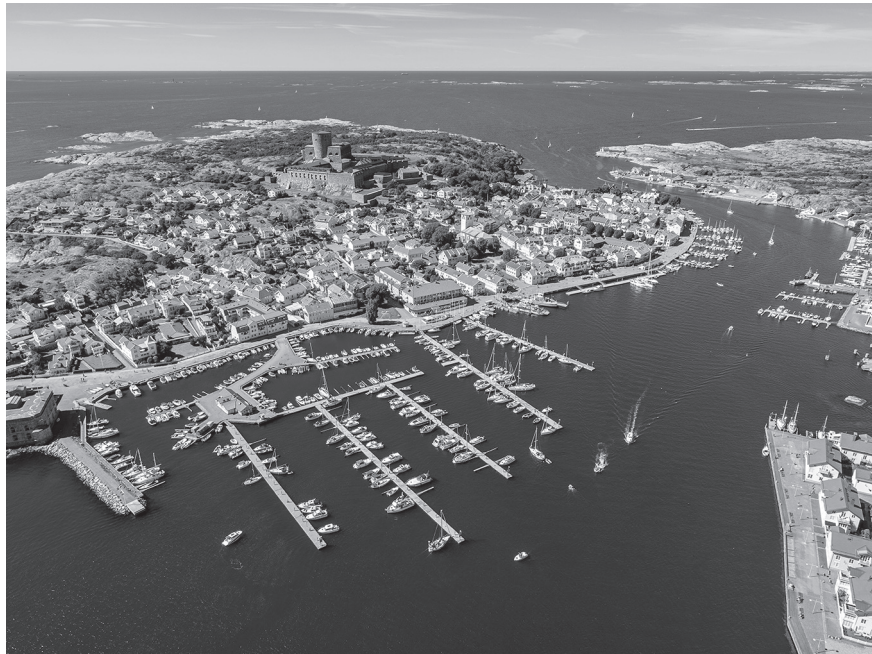
Figure 4. Aerial photograph showing Marstrand and part of Köön. The 17th-century fortress Carlsten sits enthroned over the town and its sheltered natural harbour. The church with its tower is visible among the houses, just above the centre of the photograph.

both refer to Erik Lönnroth (1963, pp. 111–112).