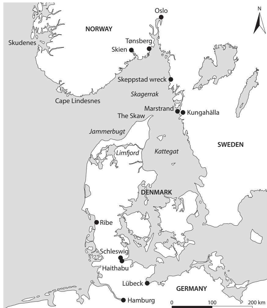
Figure 1. Map showing some of the more important locations referred to in the text. Illustration: Anders Gutehall, Visuell Arkeologi .

development of the town and its different institutions was perhaps not as straightforward as has often been assumed. It should be stressed, though, that the importance of ummeland voyaging in this context has been addressed to a certain extent also by previous scholars (Lönnroth 1963, p. 111; Carlsson 1984, pp. 53–56; Andersson 1988, pp. 179–