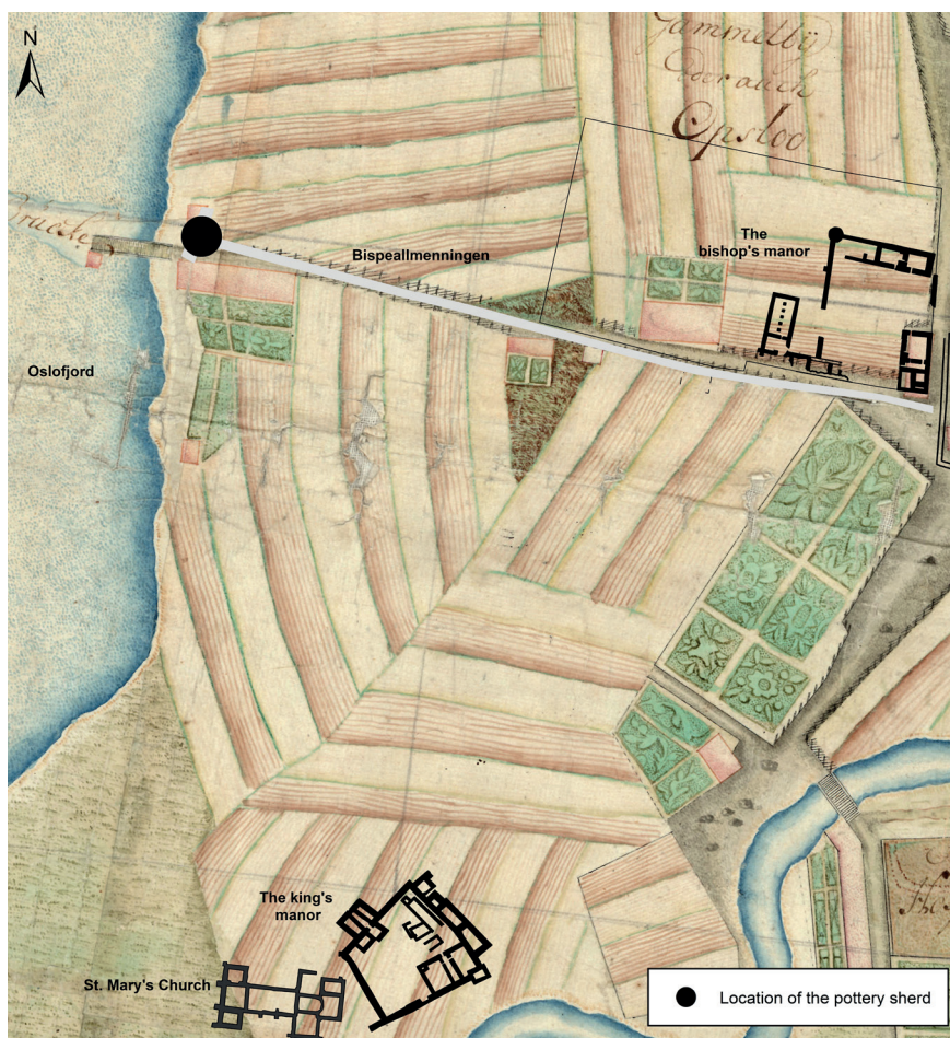
Figure 1. This map dates to 1700 CE and is the earliest map which shows Oslo's shoreline. The pottery sherd and corresponding harbour constructions lay on dry land at this point but would originally have been part of a pier which stretched out into the sea. This map also shows a pier at the end of Bispeallmenningen which illustrates how sea regression continued westwards into the eighteenth century. Map: Kristiania amt nr 7 øst: Carte von Agershuus und der Stadt Christiania (øst). Statens Kartverk.

of a wharf, which projected out from the western end of Bispeallmenningen, the road leading down from the bishop's manor to the shoreline. These deposits lay on top of a wooden harbour construction dating to the mid-15th century CE, and immediately under a new phase of building