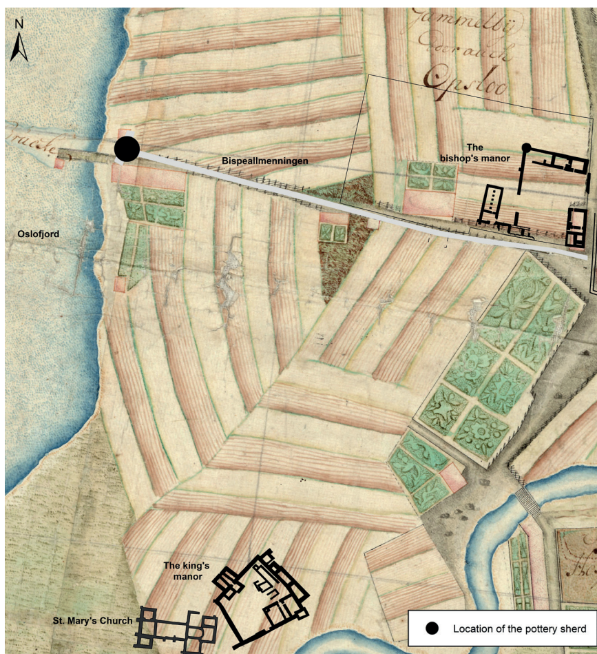
Figure 1. This map dates to 1700 CE and is the earliest map which shows Oslo's shoreline. The pottery sherd and corresponding harbour constructions lay on dry land at this point but would originally have been part of a pier which stretched out into the sea. This map also shows a pier at the end of Bispeallmenningen which illustrates how sea regression continued westwards into the eighteenth century. Map: Kristiania amt nr 7 øst: Carte von Agershuus und der Stadt Christiania (øst). Statens Kartverk.

of a wharf, which projected out from the western end of Bispeallmenningen, the road leading down from the bishop's manor to the shoreline. These deposits lay on top of a wooden harbour construction dating to the mid-15th century CE, and immediately under a new phase of building